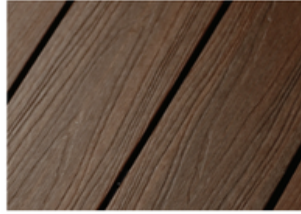
WOOD GRAIN (H6)